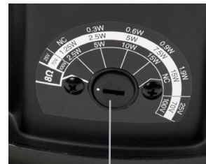
8Ω/25V/70V/100V Tap Switch