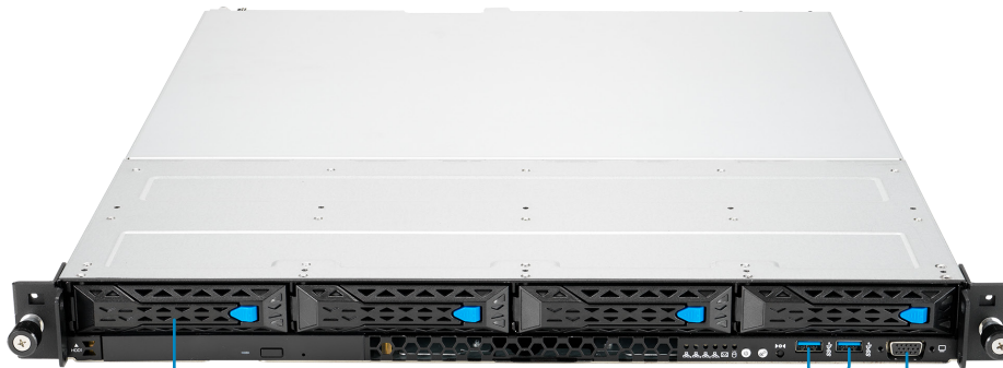
4 x 3.5 in. Hot Swappable HDD Bays

District View® provides visibility and communication to all campuses using the EPIC System (Education Paging & Intercom Communications)® interactive platform. District View allows faculty to monitor all campuses from a central location. The District View Head End Server is a fully integrated device specifically designed to keep all the functions of District View running smoothly.