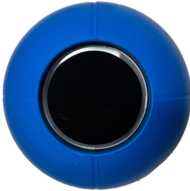
Top View With Windscreen