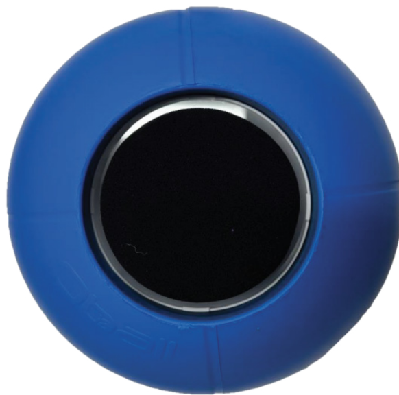
Top View With Cover

The MIC360® 2.0 offers a fun way to hear students in the classroom. It can be tossed from student to student without damage. The microphone is designed to integrate seamlessly with the EPIC (Education Paging & Intercom Communications) System®.